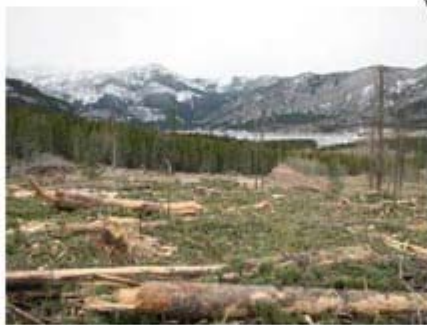
Clear cut Kananaskis